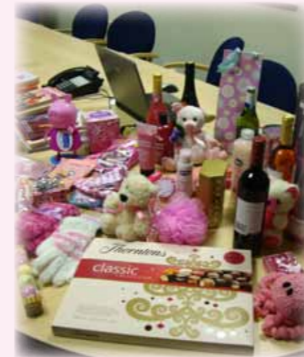
Pink Raffle prizes & books donated by our staff