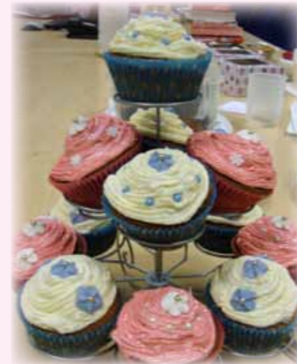
The Pink Bake Off